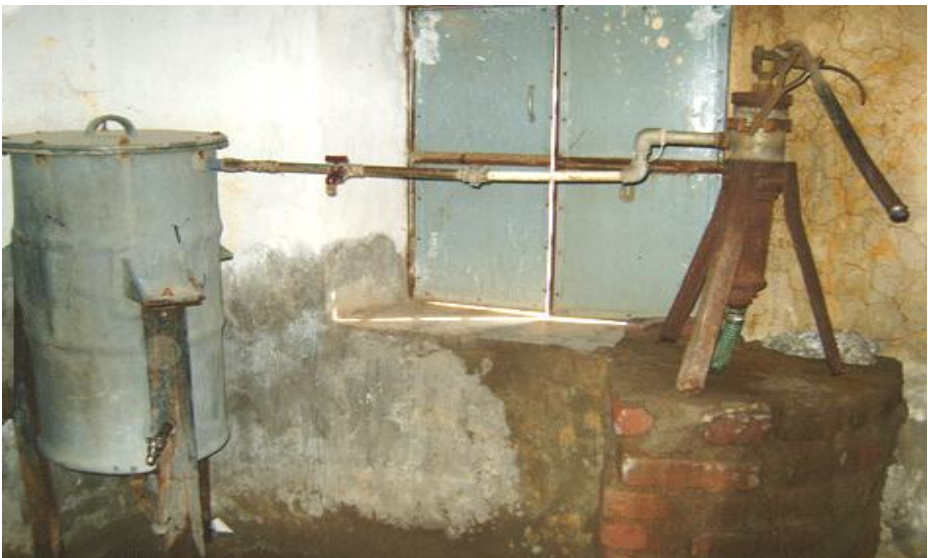
De fluoridation plant at village Jaisinghpura, Jaipur

In Rajasthan where there is water scarcity in general, it is an abnormal task to