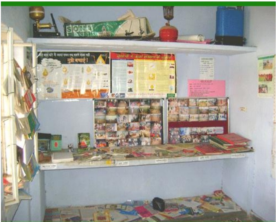
Village Information Center, Jaisinghpura, Jaipur